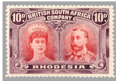
SG 149 Bright Scarlet & Mauve P. 14 Long Gash 1 - Position 2 "Long Gash in Queen's Ear"

* - Based on the classifications in 1987 Sotheby's / Gibbs Catalogue.