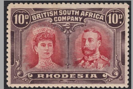
RSC-B Dp Rose-Red & 'Aniline' Dp Dull Purple P. 14 Long Gash II