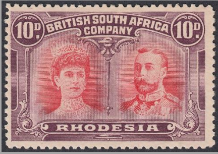
SG 149 Bright Scarlet & Mauve P. 14 Long Gash I