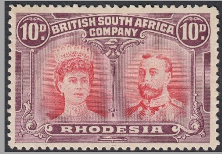
RSC-A Scarlet & Maroon P. 14 Long Gash I