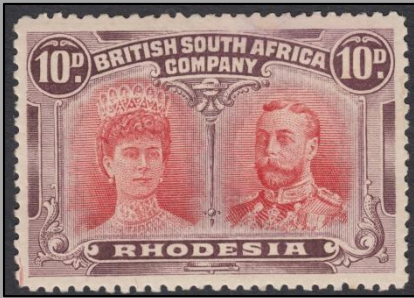
RSC-C Scarlet-Vermilion & (Purplish) Maroon P. 14 Thick Ear I (1)