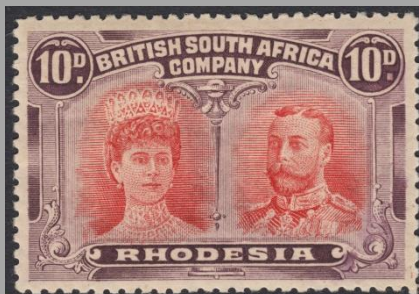
RSC-E Vermilion & Maroon P. 14 Thick Ear I (2)