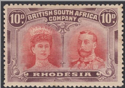
RSC-D2 Carmine-Vermilion & (Brownish) Maroon P. 14 Thick Ear I (2)