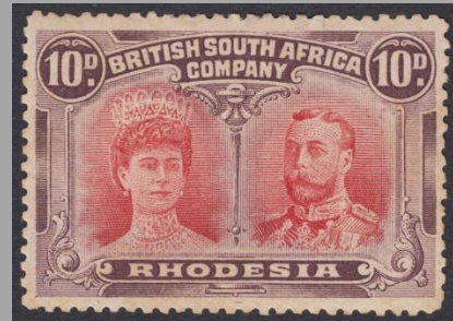
RSC-D1 Carmine-Vermilion & (Brownish) Maroon P. 14 Thick Ear I (1)