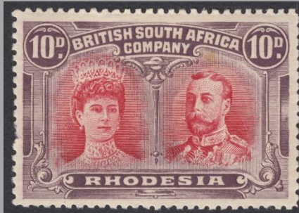
SG 150 v1 Deep Rose-Red & 'Aniline' Brown Purple P. 14 Long Gash II