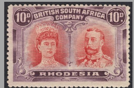
RSC-F Orange-Vermilion & Deep Dull Purple P.14 Thick Ear I (2)