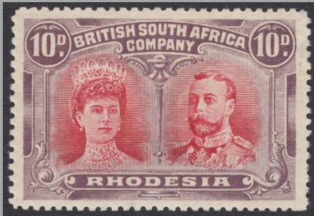
SG 150 Deep Rose-Red & Brown Purple P. 14 Long Gash II