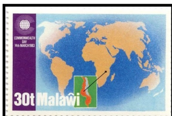
30t World map with position of Malawi