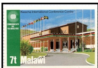
7t Kwacha International Conference Centre

The stamp shows the portrait of His Excellency, the Life President Ngwazi Dr. H. Kamuzu Banda and the National flag.