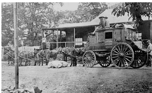
Mail coach at Mazoe

A messenger used for delivering less urgent documents and were selected among the young and energetic men. The "Post Runner" was also known as the "Chasqui". However, in case of urgent documents dispatch and delivery, horses and express wagons were used. The main challenges faced by the "Post-Runner" were unfavourable geographical conditions and unpredictable weather.